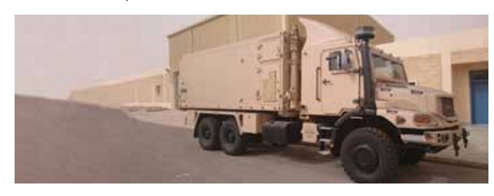
IMCP - Improved Missile Command Post

French army's benchmark all-terrain recovery vehicle. It is used extensively in overseas operations. It is used for the recovery, evacuation and extraction of immobilised vehicles and machinery.