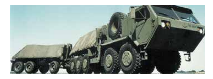
PLST - Palletized Loading System Trailer

Thanks to its large loading capacity and high mobility, the PLST ensures optimum supply to armed forces in all types of terrain.