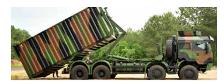
PPLOG - Multi-Purpose Logistic Carrier

8×8 vehicle with towing arm and crane. It has an armoured, pressurised cab protecting the crew from high-intensity type threats.