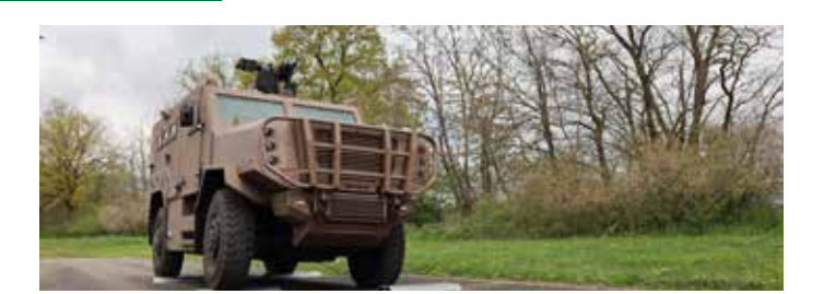
MRAP - Mine Resistant Ambush Protected

Protected rapid intervention vehicle designed to operate in extremely entangled areas and very varied terrains. Its long range and all-terrain capability make it an extremely versatile vehicle.