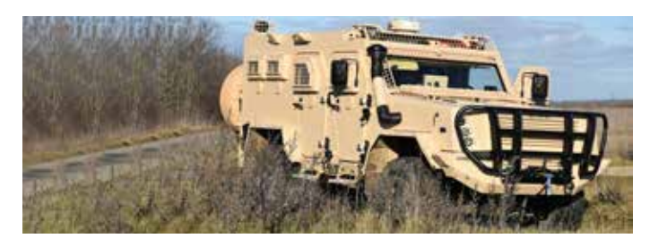
APCL - Armoured Personal Carrier Light

ARIVE is a multi-purpose protected vehicle designed to carry an infantry combat group. Its robustness, mobility capabilities and reliability have made it a benchmark vehicle.