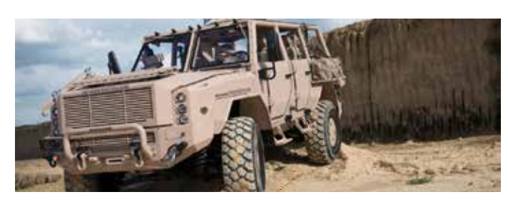
VENPIR - Multi-purpose rapid intervention vehicle

Balance between firepower and high survivability the MRAP, military vehicle, easy to use, designed to carry out operations in all theatres, thanks to its high road capabilities.